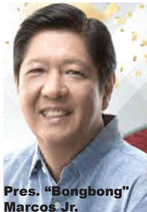
Pres. "Bongbong" Marcos Jr.

The Department of Budget and Management has approved next year's budgetary requirement of the Department of Social Welfare and Development (DSWD) for the scaled up implementation of "Walang Gutom 2027," a flagship program of the Marcos administration.