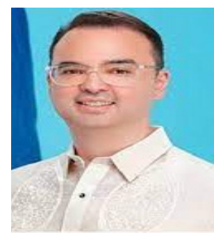
Sen. Alan Peter Cayetano

Ito ay sa gitna ng pagbabago sa pamumuno ng Senado bago ang sine die adjournment ng ikalawang regular na sesyon, at matapos maitalaga si Senador Francis Escudero bilang bagong Senate President noong Lunes.