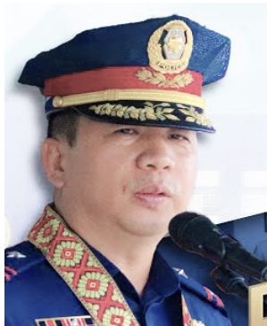
Brig. Gen. Jack Wanky is what I ask (of LGUs): if possible, they should support our police by requiring business es-

“What we want to promote is the installation of CCTVs. This