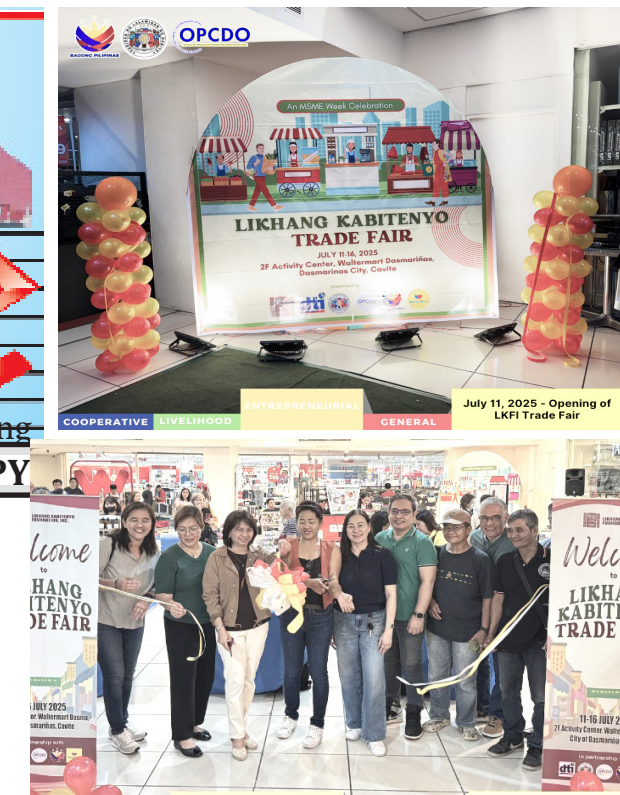
On July 11, 2025, the Likhang Kabitenyo Foundation Inc. (LKFI), in collaboration with DTI-Cavite, the Office of the Provincial Cooperative Development Officer (OPCDO), and Waltermart Dasmariñas, launched the Likhang Kabitenyo Trade Fair at Waltermart Dasmariñas, City of Dasmariñas, Cavite. The week-long event, running until July 16, 2025, showcases the products of 15 MSME-member exhibitors and aims to promote local entrepreneurship and support small businesses.