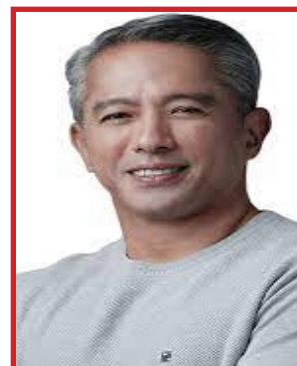
DILG Secretary Juanito Victor C. Remulla

cility on the 33-hectare property is the biggest in the country with 30,000 employees, half of whom