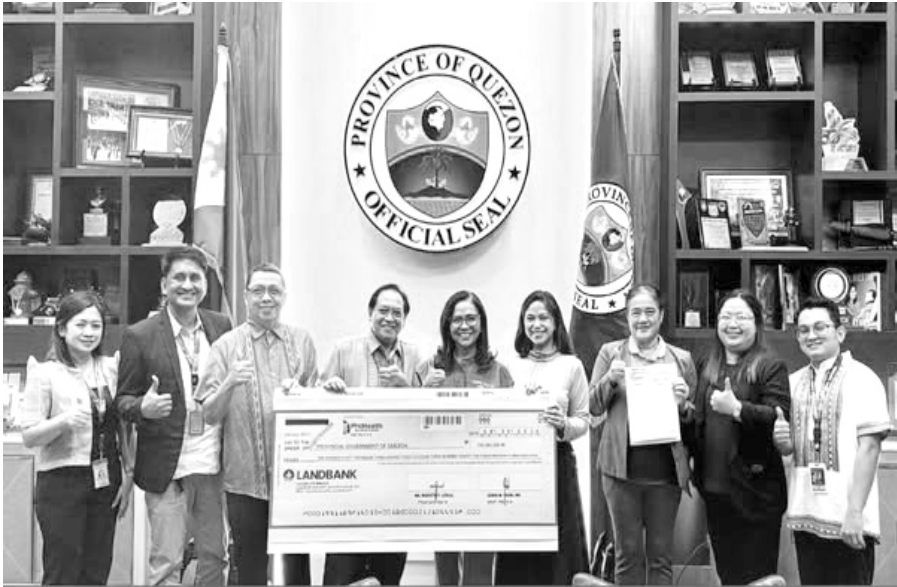
PhilHealth Regional Office IV-A Releases P132M Capitation for Quezon Primary Care Provider Network (QPCPN)

The 132M includes the remaining PhilHealth Konsulta payment for the 49 facilities for the 1st semester of CY 2023, prior to the implementation of the primary care provider network.