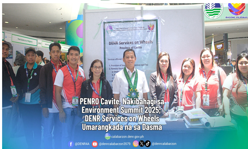
PENRO Cavite, Nakibahagi sa Environment Summit 2025; DENR Services on Wheels Umarangkada na sa Dasma

calabarzon.denr.gov.ph @DENR4A @denrcalabarzon3579 @denrcalabarzon