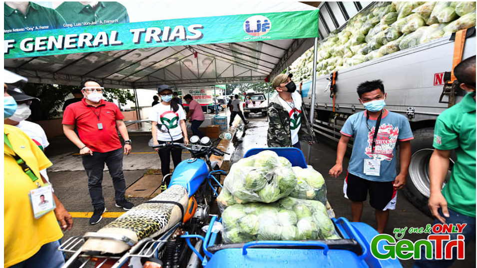
Pamamahagi ng mga gulay ng Pamahalaang Lungsod ng General Trias sa mga front liners ng bawat Pamahalaang Barangay, sa kagandahang loob ng Dyban Farms and Vegetable Supplies mula Mankayan, Benguet.