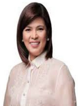
Mayor Lani Mercado-Revilla