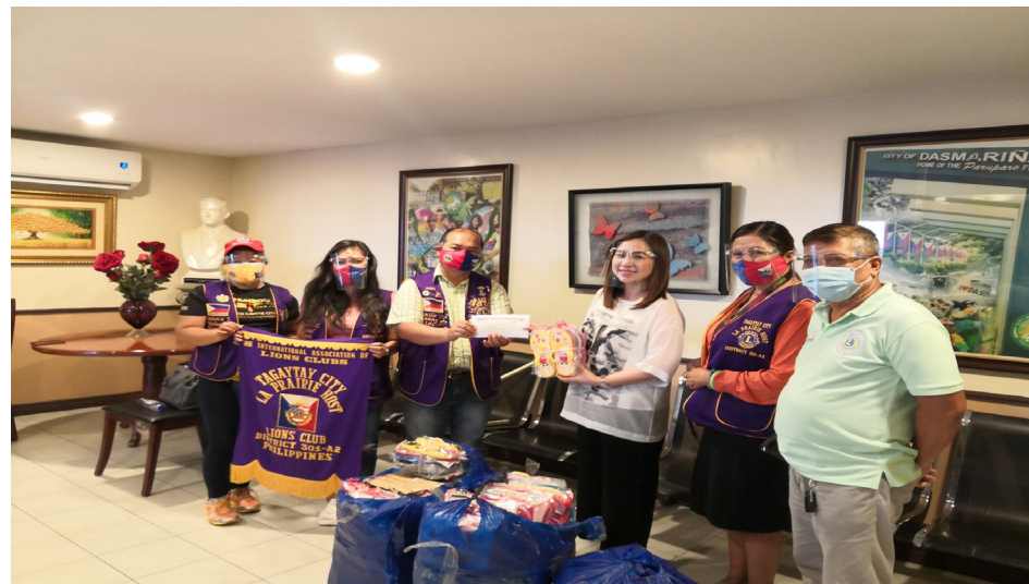
LIONS CAVITE CHAPTER donates funky, colourful slippers to children of fire victims in Sampaloc 4.

He said that the government will continue its intensified whole-of-nation approach including close monitoring and assistance to COVID-19 patients and their close contacts, quarantine or isolation facilities, management of locally stranded individuals, close coordination of funeral parlors and crematoria for the management of the dead and the missing, issuance of show cause orders to erring LGUs, and monitoring of SAP second tranche distribution.