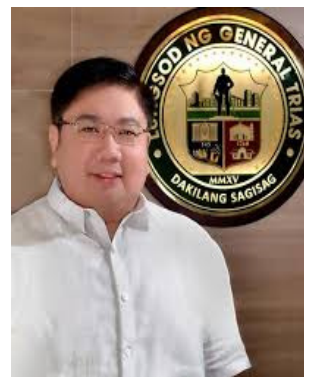
Mayor Ony Ferrer