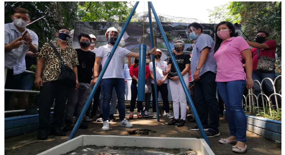
Manila Mayor Francisco 'Isko Moreno' Domagoso on Saturday, July 25, leads the groundbreaking ceremony for the construction of the 'Bagong Manila Zoo'.

According to the DENR, the zoo was dumping untreated sewage into Estero de San Antonio Abad. The facility does not