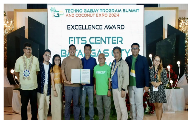
8th TGP Summit

On November 18-22, Lucena City in Quezon province became a melting pot of coconut farmers, implementing agencies, state universities and colleges (SUCs), local government units (LGUs), and even the public, merging to celebrate the 8th Techno Gabay Program Summit and 2024 Coconut Expo, with the theme: "Kultura, Sining, at Agham tungo sa Makabagong Industriya ng Pagniniyugan." The said Coconut Expo was housed for two days on November 18-19 at Pacific Mall Lu-