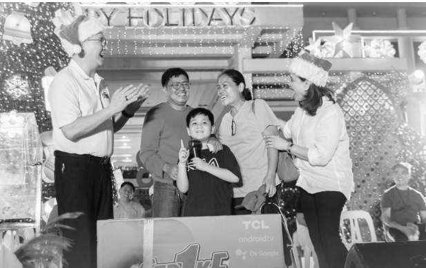
ing the City's commitment to creating a joyous and memorable holiday sea- son for its residents.