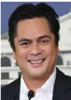
Secretary Martin Andanar