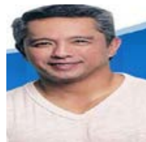
Governor Jonvic Remulla University-Health Science Institute (DLSU-HIS).

testing program with the Department of Health's granting of the level 4 status for the De La Salle