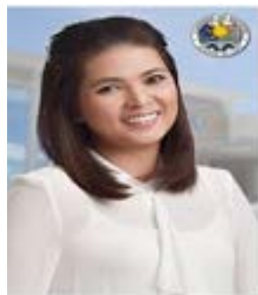
Mayor Lani Mercado Revilla