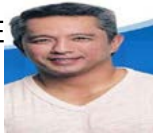
Governor Jonvic Remulla

Kinabahan kayo na? As governor I am categorically stating there will be NO total lockdown in the province of Cavite in the foreseeable future. Unless given instructions by the Office of the President, I will not implement a total lockdown.