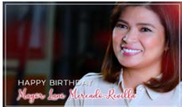
FROM: CWC STAFF