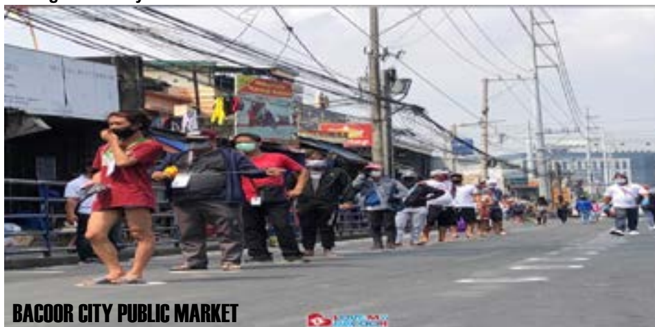
BACCOOR CITY PUBLIC MARKET

Makikita na epektibo ang paglalagay ng Social Distancing Markers sa kalsada papasok at palabas ng palengke. Napapanatili ang tamang distansiya ng mga tao na nakapila dito. Sa ganitong paraan ay mas makikitang organisado at disiplinado ang mamamayan.