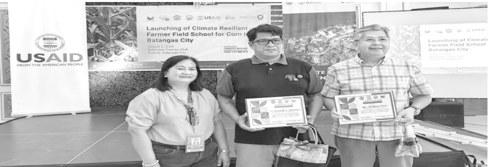
Launch of Climate Resilient Farmer Field School for Corn in Batangas City

the program. The CRFFS will run for eighteen (18) weeks and will benefit thirty (30) farmers from Batangas City Corn Growers Association (BCCGA).