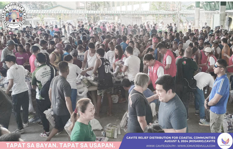
TAPAT SA BAYAN. TAPAT SA USAPAN.

Patuloy ang pagtugon ng pamahalaan upang tulungan ang mga komunidad na naapektuhan ng oil spill dulot ng lumubog na MT Terra Nova. Noong nakaraang linggo, namahagi ang pamahalaang panlalawigan ng relief packs para sa 1,600 mangingisda sa bayan ng Noveleta at 5,631 mangingisda mula