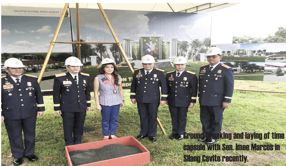
Ground-breaking and laying of time capsule with Sen. Imee Marcos in Silang Cavite recently.

CAMP CASTAÑEDA, SILANG, Cavite (PIA) – Senator Imee Marcos personally led last July 29 the ground-breaking and laying of time capsule for the proposed Philippine National Police Academy (PNPA) parade ground named after former President Ferdinand E. Marcos Sr.