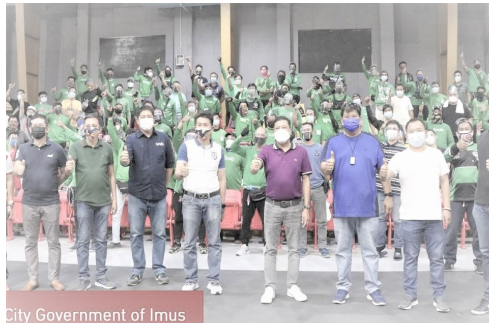
City Government of Imus