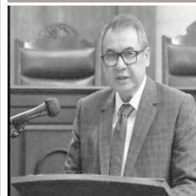
Chief Justice Alexander G. Gesmundo

"Through this new law, the jurisdictional amounts of our trial courts have now been adjusted to levels which are more suitable to the current economic conditions and property valuation in the country," said Chief Justice Alexander G. Gesmundo. "This law will no doubt help declog the dockets of our second-level