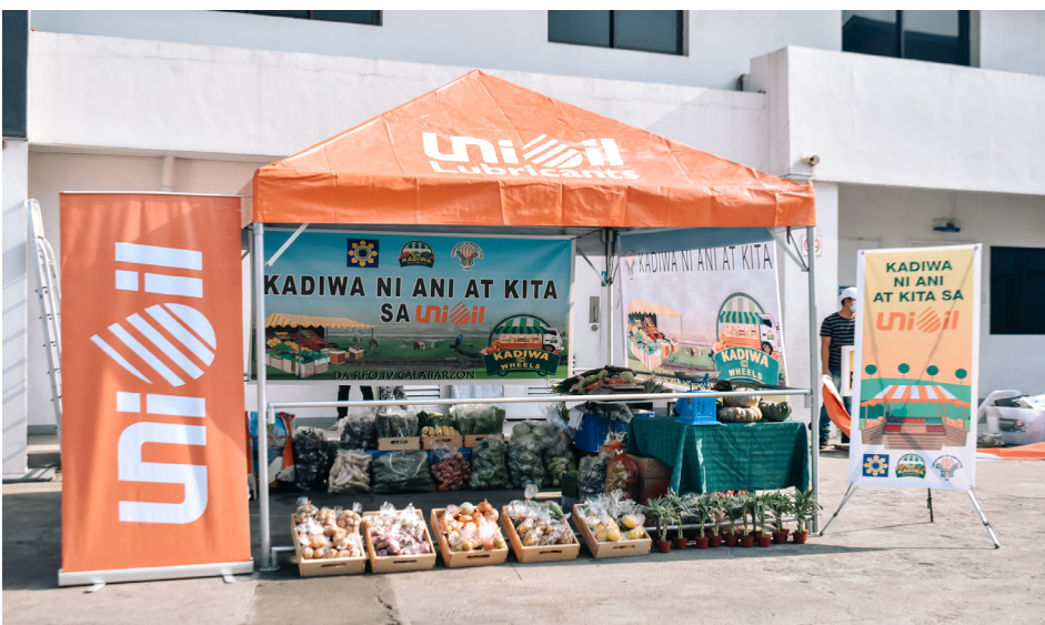
The Department of Agriculture (DA) Region 4A in partnership with the Department of Energy (DOE) and Unioil recently rolled out it's Katuwang sa Diwa at GaWA (KADIWA) ni Ani at Kita Project on Wheels at Unioil Anabu 1 and Unioil Anabu 2, Imus City, Cavite.