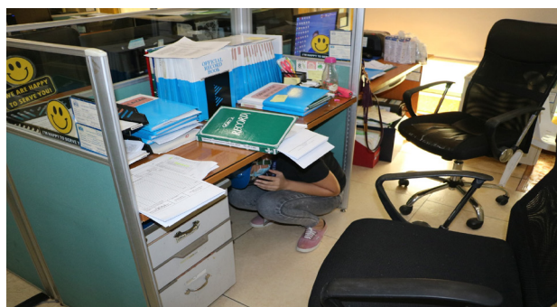
Sangguniang Panlalawigan of Cavite's Participation to the 3rd Quarter Nationwide Simultaneous Earthquake Drill held on 10 September 2020

Amidst the response for COVID-19, certain realities on the impending threats of other natural and human-induced hazards should be realized. These include the unpredictability and inevitability of the occurrence of earthquakes and other geological hazards, which remain as potential