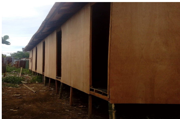
Temporary relocation facilities for the negatively affected families of the Bacoor Diversion Road project.