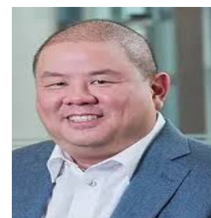
Agriculture Secretary Francisco P. Tiu Laurel Jr.

For an archipelagic nation situated along the Pacific Ring of Fire and directly facing the Pacific Ocean—both sources of extreme