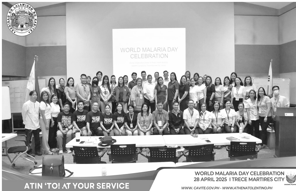
WORLD MALARIA DAY CELEBRATION 28 APRIL 2025 | TRECE MARTIRES CITY WWW.CAVITEGOV.PH | WWW.THENATOLENTINO.PH

In line with the global observance of World Malaria Day, the Office of the Provincial Health Officer (OPHO) spearheaded a province-wide celebration held last April 28, 2025, at the Cavite Collaboration Center for Public Health in Trece Martires