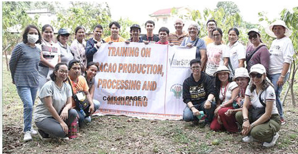
Cont.on PAGE 7