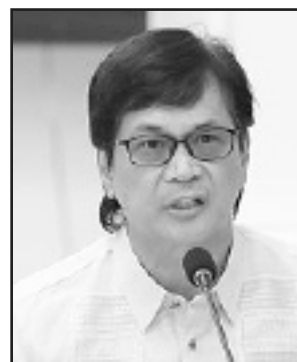
DILG Secretary Benjamin "Benhur" Abalos, Jr.

Nakiisa ang mga kinatawan ng mga sumusunod na pribadong kumpanya sa MOU signing: PLDT, Smart Communications, Maynilad, Meralco, Jollibee Food Corporation, Max's Group, Inc., Megawide Corporation, SM Corporation, Megaworld, Philippine Airlines (PAL), McDonald's, Nestle, Aboitiz, San Miguel Corporation, Metro Pacific Tollways, ETON, Ayala, Converge ICT Solutions, Inc., Blue Cross, Bench, Gokongwei Group, Lopez Holdings Corpora-