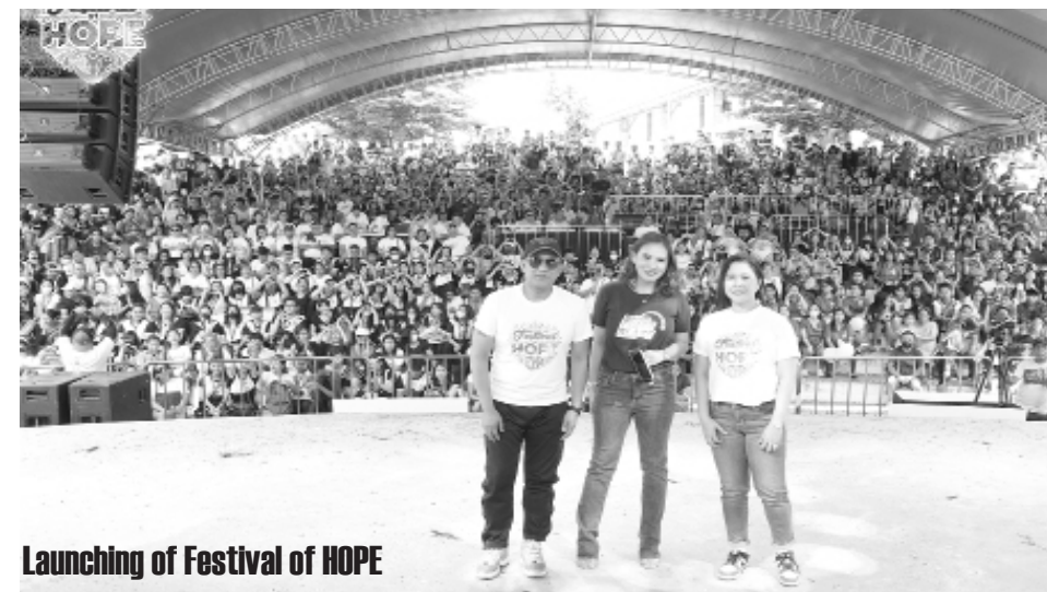
Launching of Festival of HOPE

Sana po ay napasaya namin kayong lahat. Love namin kayo. Big □