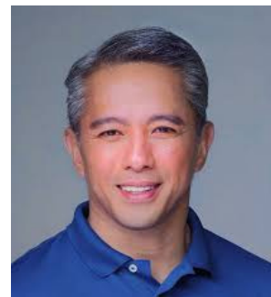
Gov. Jonvic Remulla

The Provincial Government of Cavite, thru the leadership of Governor Jonvic Remulla, in collaboration with the Department of the Interior and Local Government headed by OIC Provincial Director Eloisa Rozul, conducted a free basic services caravan on November 4, 2019 at Barangay Sta. Mercedes Multi-purpose hall and open grounds.