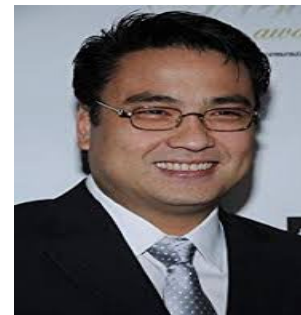
Sen. Bong Revilla

maker believes that an audit is necessary to protect people against avoidable damage to property and loss of lives.