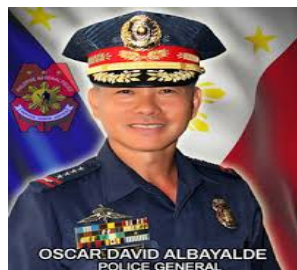
PNP CHIEF, GEN. OSCAR ALBAYALDE

The PHP350 million, state-of-the-art Regional Counter-Terrorism Training Center (RCTTC) that would rise at Camp General Mariano A. Castañeda will be jointly operated by the United States (US) and Philippine governments.