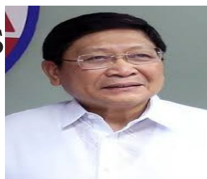
MMDA chairman Danilo Lim

GENERAL TRIAS CITY, Cavite – A city named after its Cavite-born revolutionary hero and the acknowledged first de facto vice president of the Philippine Revolutionary government during the Spanish era paid tribute to