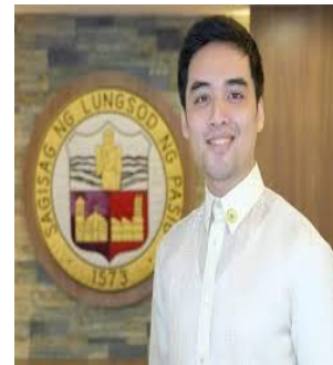
Mayor Vico Sotto

PASIG CITY--The Department of Science and Technology-National Capital Region (DOST-NCR) and the city government of Pasig on Tuesday officially opened various activities in celebration of the Regional Science & Technology Week (RSTW).