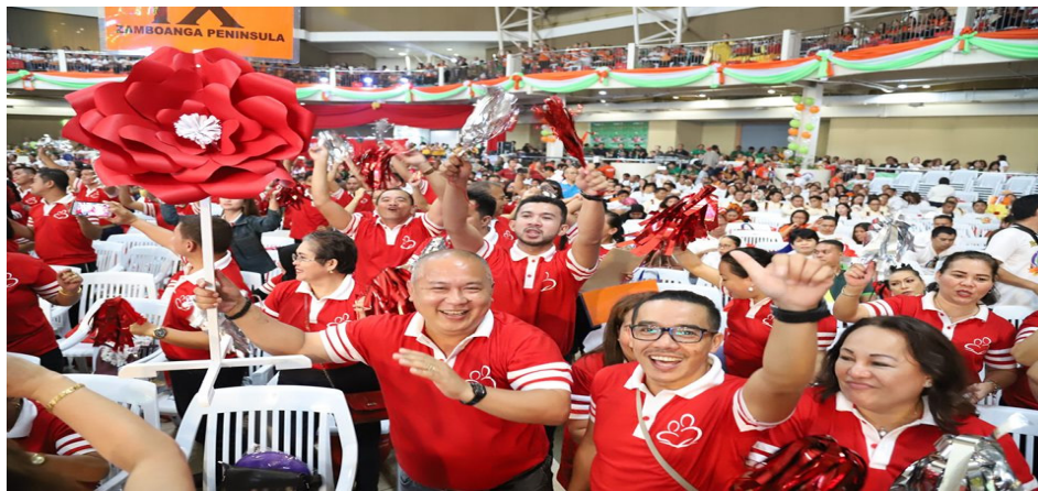
DepEd, partners, stakeholders celebrate World Teachers' Day Oct 5, 2019 at Cagayan de Oro