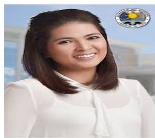
Mayor Lani Mercado-Revilla