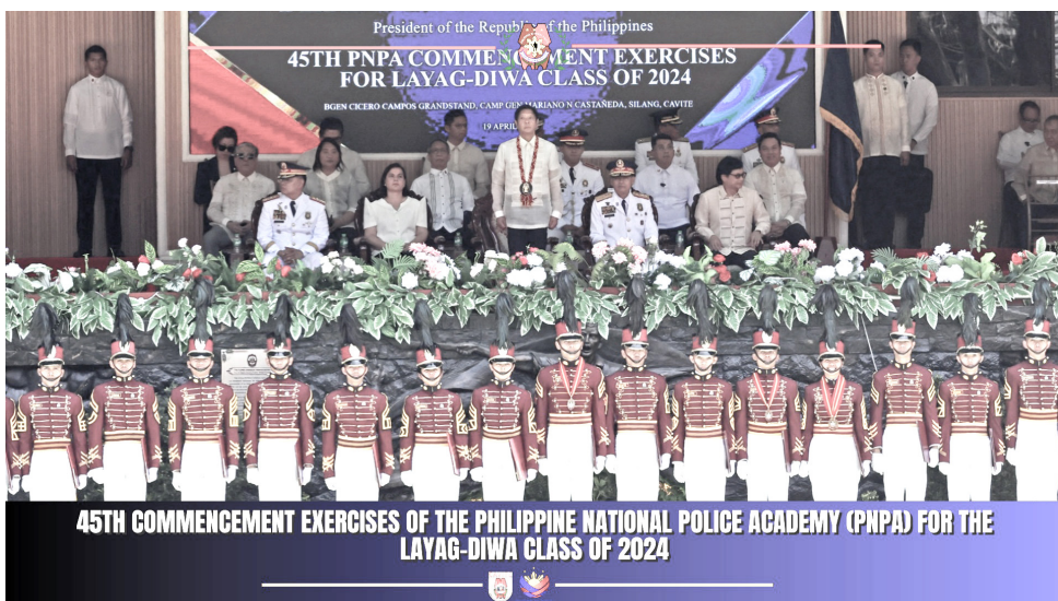
His excellency FERDINAND R. MARCOS JR graces the 45th Commencement Exercises of the Philippine National Police Academy (PNPA) for the LAYAG-DIWA Class of 2024 held at Camp General Mariano Castañeda in Silang Cavite on April 19, 2024.

sa mga batas at ordinas na ipinapatupad ng Pamahalaang Lungsod. Nagbigay naman ng mga Cont. on PAGE 5