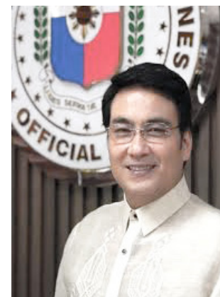
Senator Ramon "Bong" Revilla Jr.