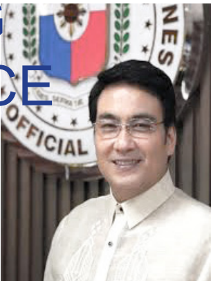
Senator Ramon "Bong" Revilla Jr.