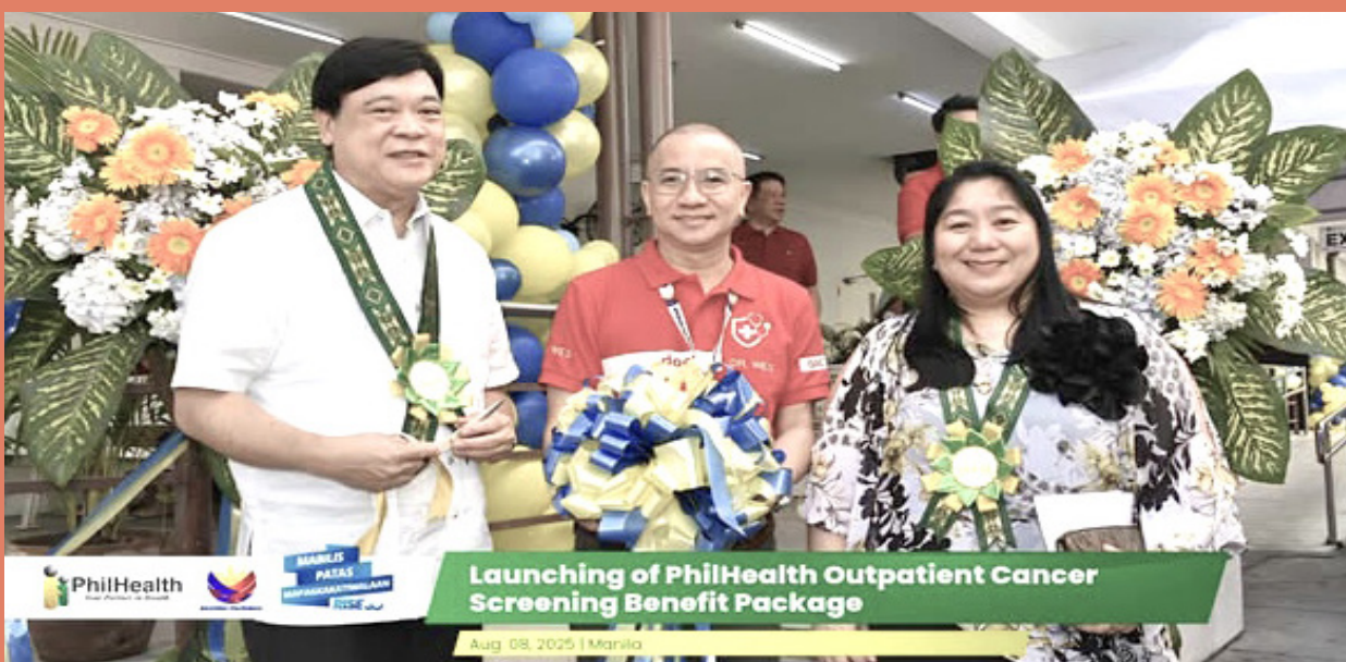
Launching of PhilHealth Outpatient Cancer Screening Benefit Package