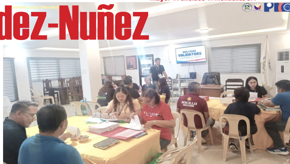
Manila Bay Clean-up, Rehabilitation, and Preservation Program (MBCRPP) LGU – Compliance Assessment in Medez-Nuñez, Cavite.

The validators also visited the Mendez Ecological Center to see the actual condition of our processing facilities and innovations, such as the elephant sculpture made from recycled tires.