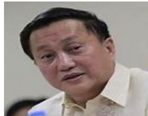
Senate Majority Leader Francis "Tol" Tolentino

MANILA — Senate Majority Leader Francis "Tol" Tolentino on Monday urged authorities to strictly enforce the 60-kilometer-per-hour (kph) speed limit on major thoroughfares following a recent deadly crash along Commonwealth Ave. in Quezon City.