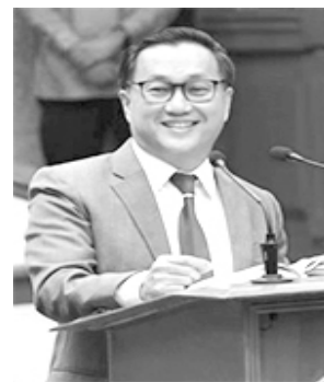
Senator Francis Tolentino

The Senator further insisted that Metro Manila should prepare a new plan for the impact