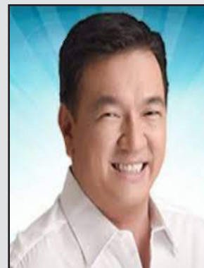
Mayor Strike Revilla