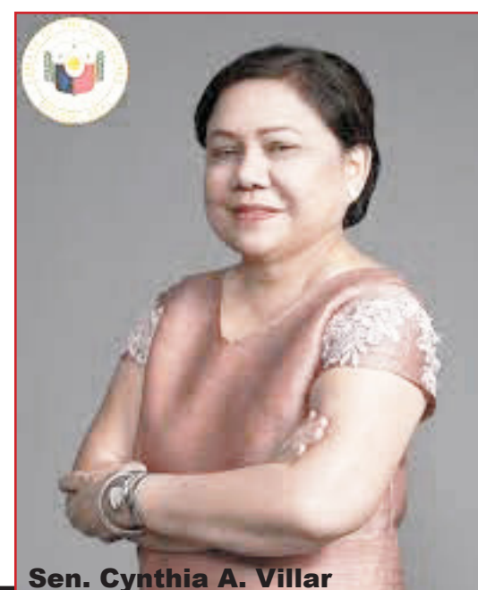
Sen. Cynthia A. Villar