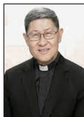
Cardinal Luis Antonio Tagle

To help eradicate rabies in a community, Sen. Cynthia A. Villar has embarked on "Libreng Kapon at Ligate" project for dogs and cats in the cities of Las Piñas and Bacoor.