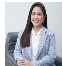
Mayor Gemma Lubigan