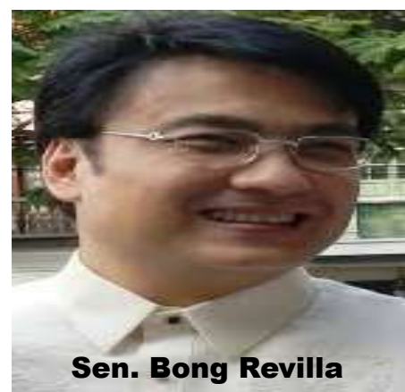
Sen. Bong Revilla

This was headed by doctors and nurses from the Asian Hospital and Medical Center, Southeast Asian Medical