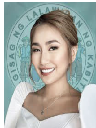
CAVITE GOVERNOR ATHENA BRYANATOLENTINO

Kasama ni Governor Athena sa programa si Tagaytay City Cont. on PAGE 4