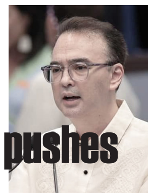
Senator Alan Peter Cayetano

The distribution of incentives marks the provincial government's continued commitment to recognizing and supporting the invaluable contributions of community health and nutrition workers. — OPIO