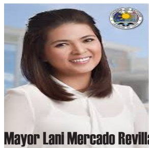
Mayor Lani Mercado Revilla

Nabigyan na ang mga qualified Bacooreño na makatanggap ng ayudang pinansiyal mula sa National Government. Mga kawani ng DSWD ang nangasiwa sa distribution ng funds, kaagapay ang barangay officials at PNP Bacoor. Ang nasabing pamimigay ay