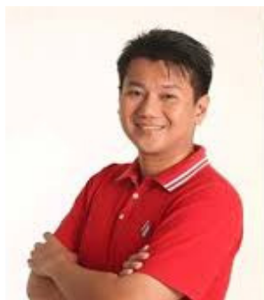
Mayor Emmanuel L. Maliksi

These tents, Field Hospital, are air-conditioned with 10 hospital beds for each tent, a stand-by oxygen tank beside every bed, and a portable X-ray machine recently procured by the city government to equip the Field Hospital in the treatment of coronavirus disease