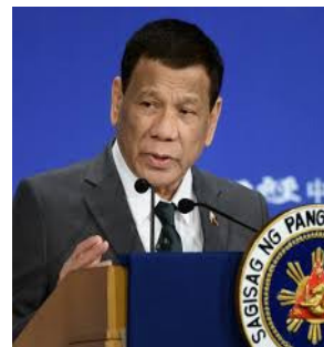
Pres. Rodrigo Duterte