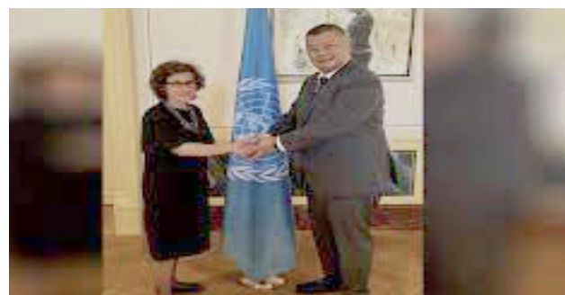
MEETING WITH UNHCHR. Justice Secretary Jesus Crispin Remulla meets with UN Acting High Commissioner for Human Rights Nada al-Nashif at the Palais Wilson in Geneva, Switzerland on Oct. 4, 2022.

Department of Justice (DOJ) Secretary Jesus Crispin Remulla has met with the United Nations Acting High Commissioner for Human Rights in Geneva, Switzerland on Oct. 4.