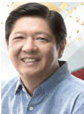
Pres. "Bongbong" Marcos Jr.

Sinabi pa ng opisyal na ang railway system