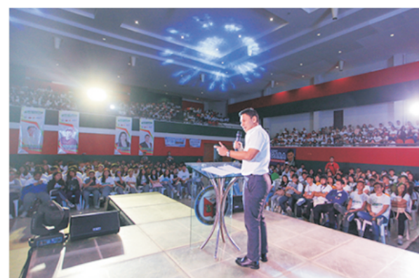
Sen. Angara rallies young Gentrissenos for nation building: Sen. Sonny Angara delivers a speech during the 7th General Trias Youth Leaders Summit with the theme "Young Gentrissenos: Transforming Vision into Action."