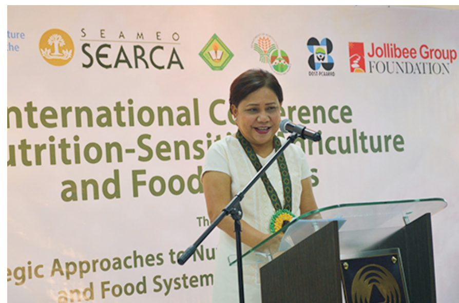
Proper nutrition is among the priorities of the government, says Villar: Speaking during the UPLB-Interdisciplinary Studies Center on Food & Nutrition Security (ISC-FaNS), International Conference on Nutrition-Sensitive Agriculture and Food Systems, Sen. Cynthia Villar emphasizes that a healthy citizenry can only translate to a healthy nation. Due to this, the senate says she has been encouraging everyone to plant their own vegetables to have accessible and steady supply of nutritious food. "Others may not see this as a "real solution", but it is and even the most developed countries are going back to basics," says Villar during the conference held at the Development Academy of the Philippines. In the photo with Villar are (L-R)- Cavite Gov. Jesus Crispin Remulla; Dr. Domingo Angeles, Professor & Chair, ISC-FaNS, College of Agri & Food Science, UPLB; Dr. Fernando Sanchez Jr., Chancellor, UPLB chancellor and Dr. Hernando Robles, President, Cavite State University.

Services of the "Business One-Stop-Shop" service will continue until February 8, 2019 during office hours. (PNA)