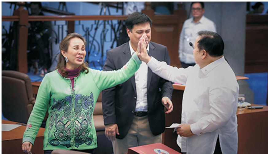
Approved!: This seems to be what Senators Loren Legarda, Richard Gordon and Majority Leader Juan Miguel Zubiri have agreed after scrutinizing Thursday night the proposed P19.66 billion 2019 budget of the Department of Foreign Affairs (DFA) during the marathon deliberations on the General Appropriations Act (GAA) for the coming year.