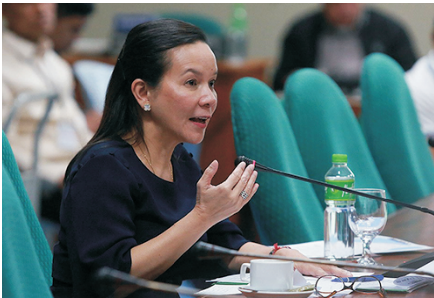
Why let the buses out?: Sen. Grace Poe, chairperson of the Senate Committee on Public Services, questions officials of the Land Transportation and Franchising and regulatory Board for allowing more than 300 provincial buses to traverse along EDSA and Roxas Blvd. instead of terminating their routes at the newly-opened Paranaque Integrated Terminal Exchange (PITX) during a public hearing Tuesday, December 4.