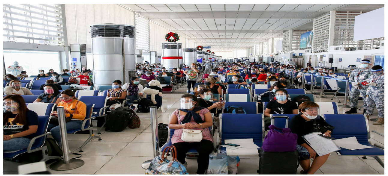
Hundreds of distressed overseas Filipino workers (OFWs) arrive at the Ninoy Aquino International Airport on Sept. 26, following their repatriation from Beirut, Lebanon. PHOTOcourtesy FROM PCOO

As the church currently celebrates 34th National Migrants Sunday, he encouraged everyone to replicate the effort "that conveys care, compassion, acceptance and welcome" for OFWs in distressful situations. "Each of us can do something in whatever way possible," he said.source: CBCP News