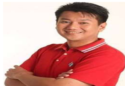
Mayor Emmanuel Maliksi