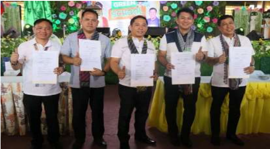
IMUS CITY ‘GREEN SCHOOL’ PROJECT – City mayor Emmanuel Maliksi (2nd from right), along with vice mayor Arnel Cantimbuhan (rightmost) and other Department of Education (DepEd) signatories, flash the thumbs-up sign following the forging of the memorandum of agreement (MOA) on the green school program at the Imus National High School (INHS) main campus on Feb. 18, 2019.