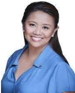
SEN. NANCY BINAY

Binay filed Senate Bill number 182 in the present Congress that would make regular employees of the government the punong barangay, members of the barangay council, including