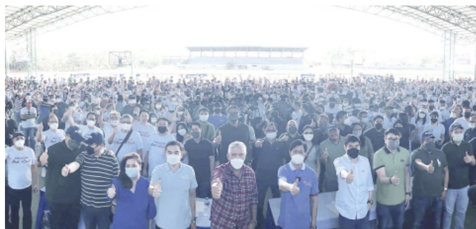
Bumisita ang tambalang Lacson-Sotto sa lungsod ng General Trias nitong Biyernes kung saan sinalubong sila ng kanilang mga taga-suporta kamakailan.