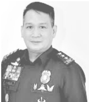
PNP chief, Gen. Dionardo Carlos

every crucial action, this must have the authority of the Comelec," PNP chief, Gen. Dionardo Carlos said in a statement.