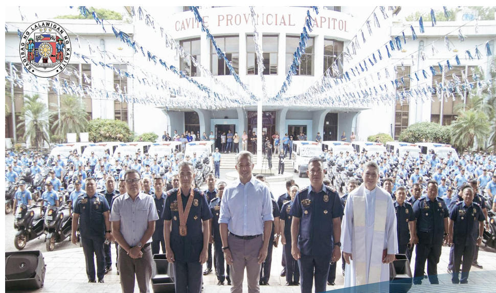
TAPAT SA BAYAN. TAPAT SA USAPAN.

DISTRIBUTION OF PEACE AND ORDER VEHICLES MARCH 20, 2024 | PROVINCIAL CAPITOL GROUNDS, TMC WWW.CAVITE.GOV.PH - WWW.JONVICREMULLA.COM