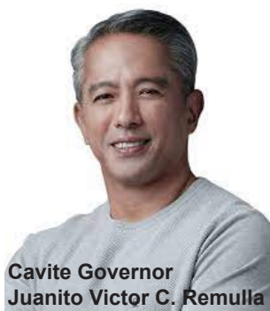
Cavite Governor Juanito Victor C. Remulla

The Provincial Government of Cavite led by Governor Jonvic Remulla bolstered its commitment to ensure peace and order in the province with the distribution of new vehicles to