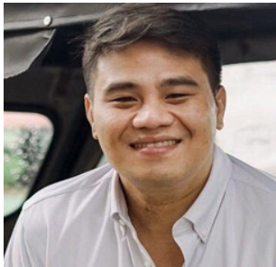
Mayor Angelo Aguinaldo

kababayan nilang nagbabagong buhay. Sa isang Facebook post naman ipinahatid na Mayor Angelo Aguindo ang kanyang pasasalamat sa Kawit RHU at PNP Kawit para sa pangangasiwa sa nasabing medical mission. | via Angelo G. Aguinaldo