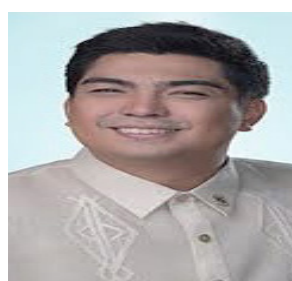
1st District Rep. Jolo Revilla