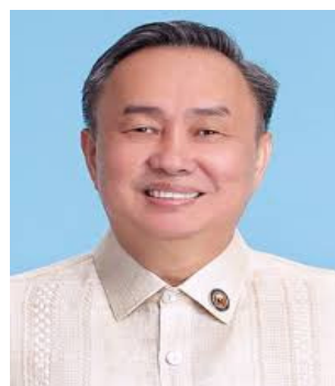
Tagatay City Mayor Abraham Tolentino

TRECE MARTIRES CITY - Six (6) city mayors of Cavite Province made it to the Top Ten Performing City Mayors of CALABARZON (Cavite, Laguna, Batangas, Rizal, Quezon) Region IV-A for the first quarter of 2024. Mayor Abraham Tolentino of Tagatay City is Top 2 with a rating of 86.5%; Mayor Denver Chua of Cavite City, Top 3, with 82.3%; Mayor Strike Revilla of Bacoor City with a rating of 80% and Mayor Alex Advincula of Imus City with 79.6% share the 4th place; Mayor Jenny Bar-