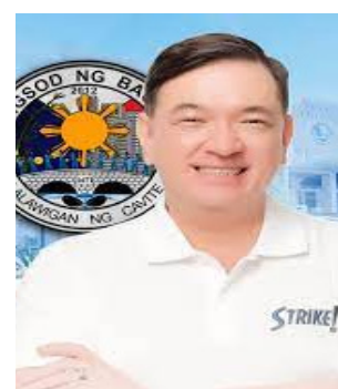
Bacoor City Mayor Strike B. Revilla

Mayoral leadership effectiveness in Region IV-A and B (CALABARZON and MIMAROPA) for the first quarter of 2024. He stressed that the survey which encompasses a