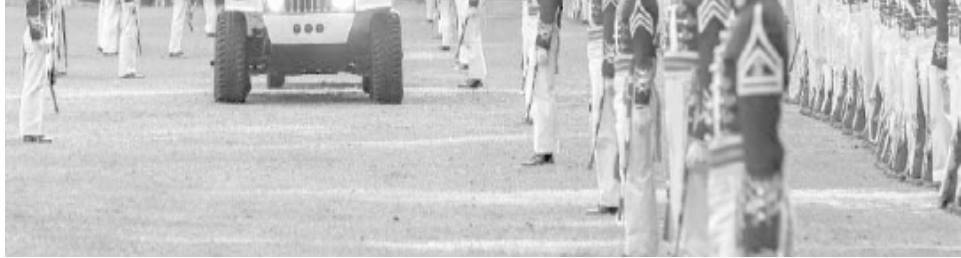
BE PROFESSIONAL. President Rodrigo Roa Duterte attends the graduation rites of the Philippine National Police Academy “Alab-Kalis” Class of 2022 in Silang, Cavite on Thursday (April 21, 2022). He urged the graduates to maintain their professionalism by heeding the call of duty without acting beyond their legal parameters.

hope that the graduates would sustain the “same level of courage, determination and passion” as they join the Philippine National Police (PNP), the Bureau of Fire and Protection (BFP), and the Bureau of Jail Management and Penology (BJMP). He also told them to avoid acting beyond their legal parameters, reminding them that their mandate is to serve and protect the Filipino people. “Although our war with lawless forces is far from over, I am proud to say that we have made great strides in improving the crime situation in the country,” Duterte said. “Always be reminded that the core of your profession is and will always be the welfare of our people.” Legal assistance Duterte, a lawyer, said he is willing to provide legal assistance to cops even after his term ends in 2022, so long as they are performing their duties within the bounds of the law. He reiterated his “love” for the policemen who help maintain law and order in the country under his watch. “Maski retired na ako (Even if I retire already), if you want my help, lalo na ‘yung masabit kayo in a legitimate operation, nandyan ako (especially those who will face charges after conducting a legitimate operation, I will be here for you). And maybe I will appear in court for you,” Duterte said.