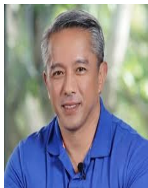
Governor Jonvic Remulla

Submit documents via e-mail at accreditationdot4a@gmail.com or accreditation4a@tourism.gov.ph .