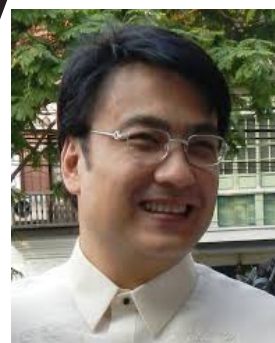
Senator Ramon Bong Revilla, Jr.

As the author of Senate Bill No. 458 which Cont.on PAGE4