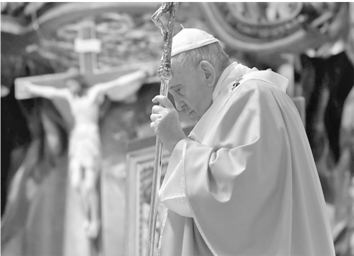
Pope Francis celebrates Mass at St. Peter's Basilica to mark 500 years of Christianity in the Philippines on March 14, 2021.

walk this path. Never be afraid to proclaim the Gospel, to serve and to love," the pope said. "How beautiful and attractive is a Church that loves the world without judging, a Church that gives herself to the world."