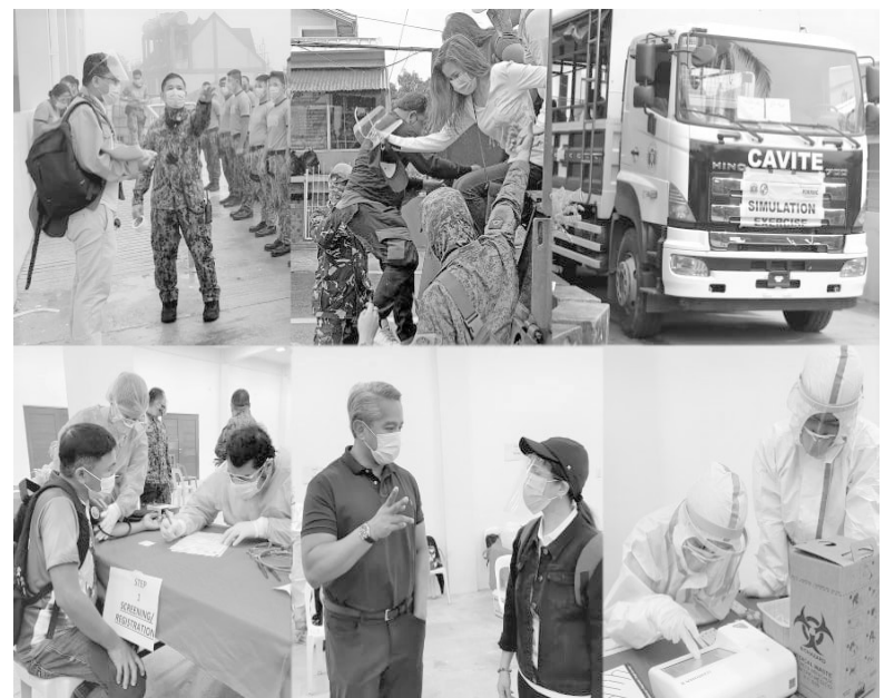
LGU Cavite and Batangas during simulation exercises for the Taal Volcano Eruption Evacuation Plan on Monday, March 15, 2021 in partnership with Local DRRM offices./Story on p6