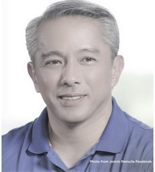
Gov. Jonvic Remulla

CAVITE — The provincial government will not impose a boundary control policy despite the rising number of COVID-19 cases linked to more relaxed restrictions among other factors, according to Governor Jonvic Remulla.