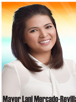
Mayor Lani Mercado-Revilla

According to Mayor Lani Mercado Revilla, "I am very pleased to know that our frontliners have been vaccinated. They are the ones who are directly dealing with Covid-19 every day so it is worth giving them importance and protection. Let's try after our medical practitioners are