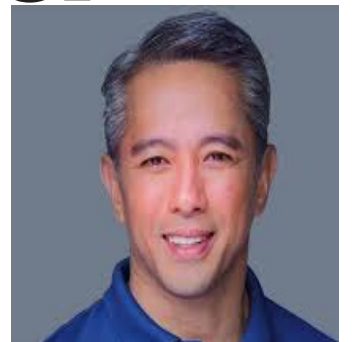
Governor Jonvic Remulla

TRECE MARTRES CITY, Cavite (PIA) -- Cavite Governor Jonvic Remulla advised all Caviteños returning to work today to take all precautionary measures for their protection against the coronavirus disease (COVID)-19 and expect heavy traffic congestion along the major thoroughfares going out to NCR.