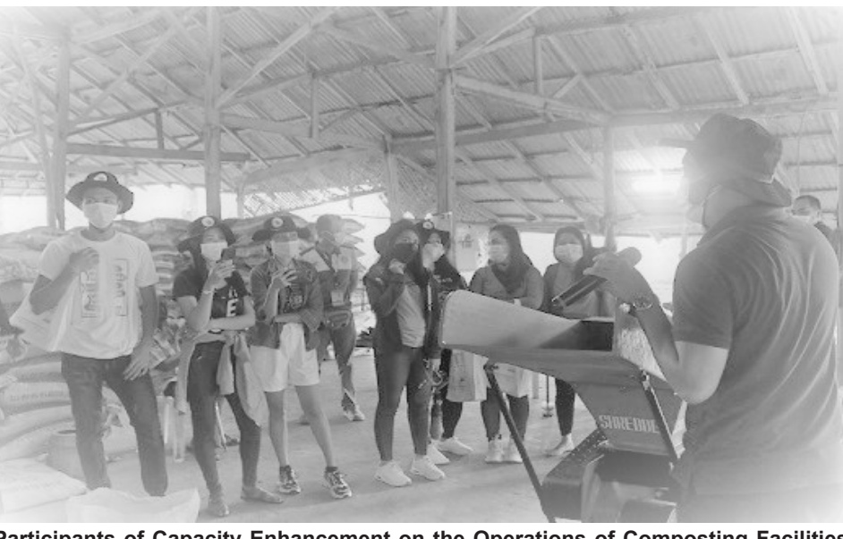
Participants of Capacity Enhancement on the Operations of Composting Facilities for Biodegradable Wastes (CFBW) during their field visit in composting facilities located at Forest Park, Trece Martires City, Cavite on June 9, 2021

petitive advantage because the consciousness of travelers is already very high.