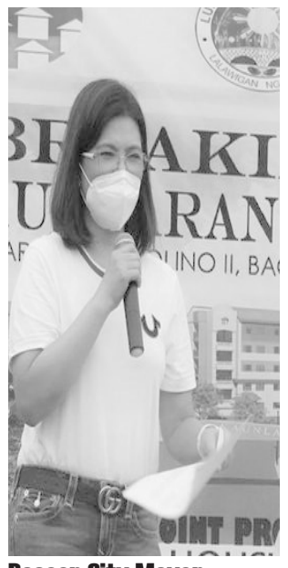
Bacoor City Mayor Lani Mercado Revilla

The groundbreaking ceremony of Ciudad Kaunlaran on June 8, the in-city resettlement site for the informal settler families who will be included in the relocation caused by the coastal easment of Bacoor Bay. It is expected to have 1,800 units in the 4-storey medium rise buildings in the City.