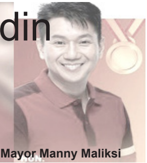
Mayor Manny Maliksi