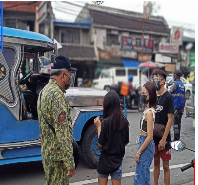
Our Oplan Sita police continue to carry out in public places. Recently they are in Zapote Market to remind our countrymen, including buyers, sellers and sellers, tricycle and jeepney drivers, about following health and safety protocols. That includes the proper wearing of face mask and face shield, following social distancing, and washing hands all the time.