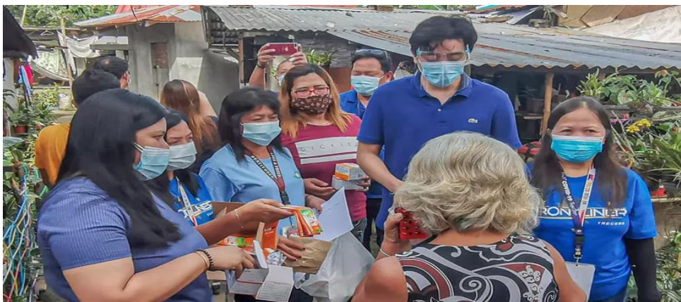
Botika on Wheels at Trece Martires City

Botika on Wheels helped 1,800 senior citizens