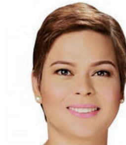
Davao Mayor Sara Duterte

It said political personalities with the highest media coverage on traditional media and posted on Facebook are Robredo followed by Pacquiao, and More-