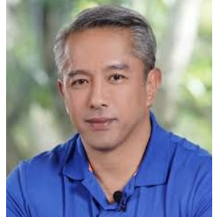
Cavite Governor Jonvic Remulla