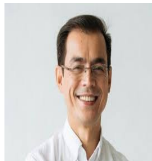
Manila Mayor Isko Moreno