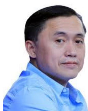
Sen. Bong Go