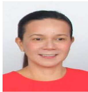
Sen. Grace Poe