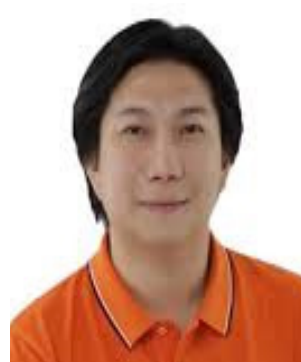
Noveleta Mayor Dino Chua