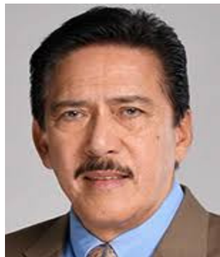
Sen. Tito Sotto