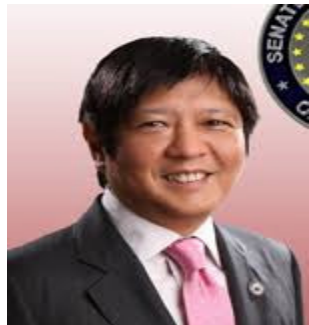
Sen. Bongbong Marcos