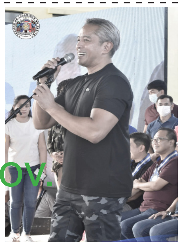
Cavite Governor Juanito C. Remulla