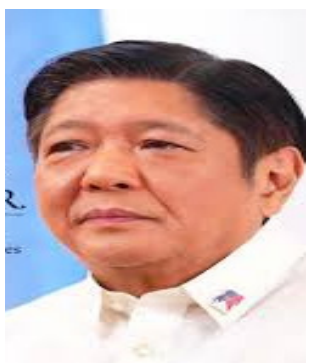
Pres. Ferdinand Marcos Jr.

MANILA – President Ferdinand R. Marcos Jr. has called on the Philippine media to help his administration in its efforts to step up its campaign to inform the public of the government's policies, programs, and achievements. Marcos made the call, as he led the oath-taking of the new-