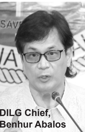
DILG Chief, Benhur Abalos

"Hindi natin puwedeng iasa na lamang sa Philippine National Police at sa Philippine Drug Enforcement Agency ang kampanya laban sa iligal na droga dahil lahat tayo ay apektado dito. Kailangang lahat tayo ay kumilos na at makiisa para tuldukan ang salot na patuloy na sumisira sa kinabukasan ng ating mga kabataan," he said. Since President Ferdinand R. Marcos Jr. assumed office in July this year, the PNP's aggressive campaign against illegal drugs resulted in the confiscation of some P9.7-billion worth of various illegal drugs confiscated and the arrest of 22,646 drug personalities in 18,505 anti-illegal drug operations nationwide. Abalos said the anti-drugs campaign under the administra-