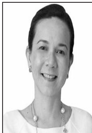
Sen. Grace Poe

also been observed that traditional print and broadcast media brand have been more resilient to accusations of fake news as compared to social media platforms and digital news outlets.