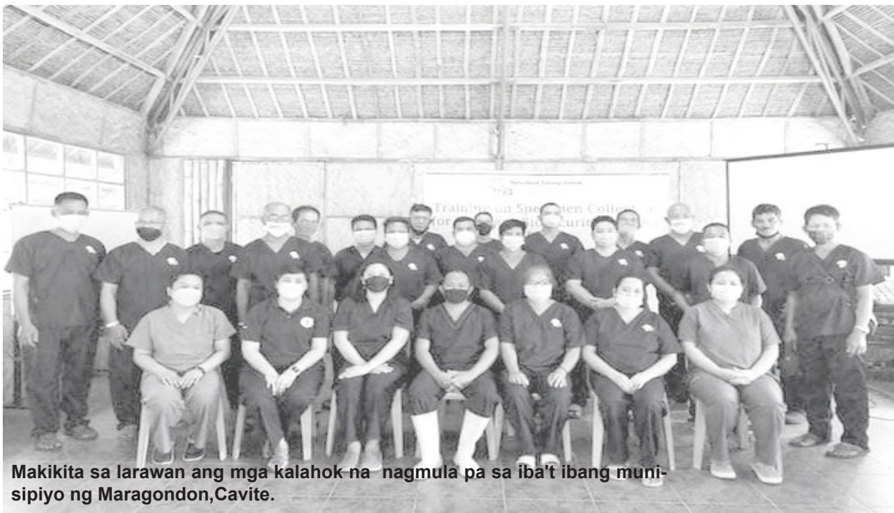
Makikita sa larawan ang mga kalahok na nagmula pa sa iba't ibang muni- sipiyo ng Maragondon, Cavite.

Martires City noong ika- 23 ng Marso, 2022. Ang pagsasanay na ito ay hango sa konsepto ng pagiging sensitibo sa kasarian upang maba- wasan ang mga hadlang o balakid sa kaunla- rang pang-ekonomiya at pangsarili, pagkilala sa mga epekto ng mga gender-related stress sa mga tanggapan at pagtu- koy sa mga maaaring pinagmumulan ng mga ito gayundin ang maaar- ing solusyonan dito. Dalawampung (20) kawani mula sa OPA Cavite ang lumahok sa isang (1) araw na pag- sasanay na nakatuon sa kagalingang pang-emo- syon patungo sa sosyal-