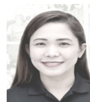
TMC Mayor Gemma Lubigan