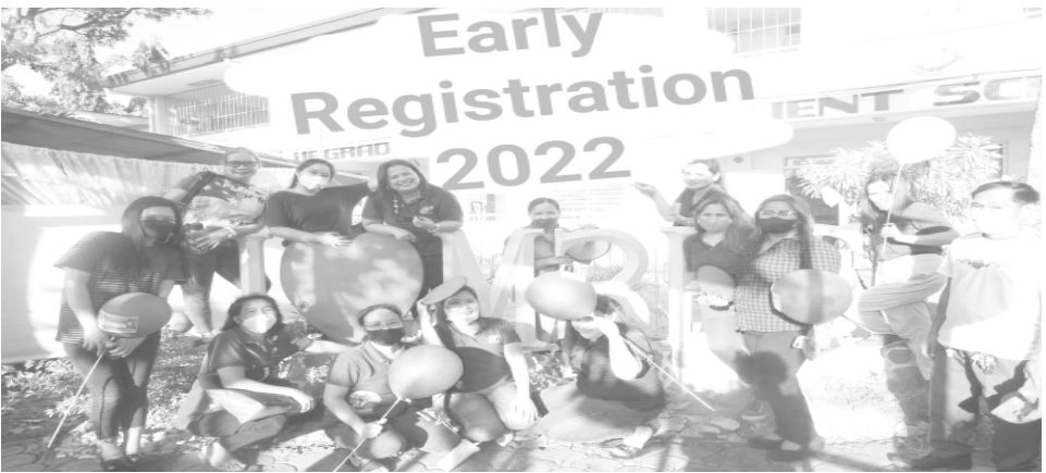
EARLY REGISTRATION:Malagasang III Elementary School, SDO Imus City conducted a motorcycle caravan in the covered barangays of Malagasang II-D, II-E, II-F and II-G as part of the Early Registration campaign. They are with the GPTA officers and barangay officials. This also includes providing flyers for additional information about the program.