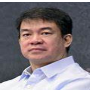
Minority Leader Aquilino "Koko" Pimentel III

tion emphasized that the award was given to "deserving PNPAAAI honorary, adopted, or associate members for having demonstrated exemplary performance in their respective fields or professions that greatly contributed to the ac-