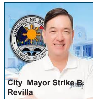
City Mayor Strike B. Revilla