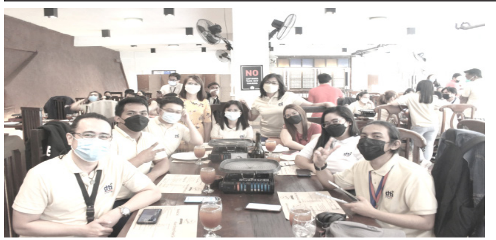
DTI Cavite Year-end Assessment & Planning held on 27 December 2021 at Trece De Fortaleza, Trece Martires Clty.