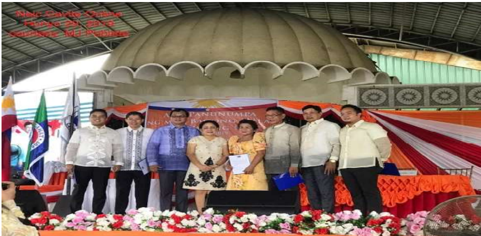
Ang mga nanumpang konsehal ng Naic, kasama ang tagapagtalagang si Sen. Cynthia Villar.

Pinangunahan ni Senador Cynthia Villar ang panunumpa sa tungkulin ng mga halal na opisyal ng Naic. Nagbukas na rin ang isinabatong Tulay ng Saluysoy na naisakatuparan sa tulong ng senador noong nakaraang Hunyo 29, 2019 sa bayang ito.