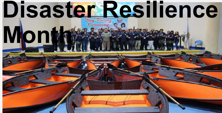
Mayor Lani Mercado Revilla presented a review of her administration's