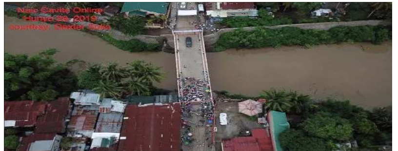
Tagpo sa pagbubukas ng Tulay ng Saluysoy, umaga ng Hunyo 29, 2019.