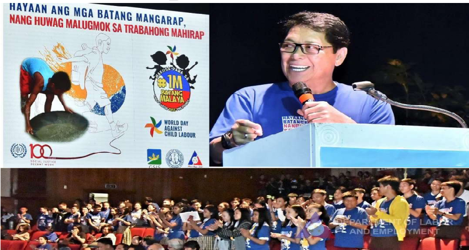
Labor Secretary Silvestre Bello III leads the observance of World Day Against Child Labor at the GSIS Theater in Pasay City.

MANILA-he labor department has strengthened its commitment of achieving a child-labor free Philippines as it pushes for more inclusive and preventive interventions in combatting child labor and its worst forms. Labor Secretary Silvestre Bello III said DOLE has so far profiled 85,582 child laborers in 16 regions of which 18,651 were referred to appropriate agencies for the provision of services and assistance needed by the children and their families.