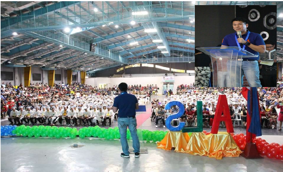
Pagtatapos ng mga mag-aaral ng Alternative Learning System (ALS) Hulyo 2, 2019,Imus City, Cavite