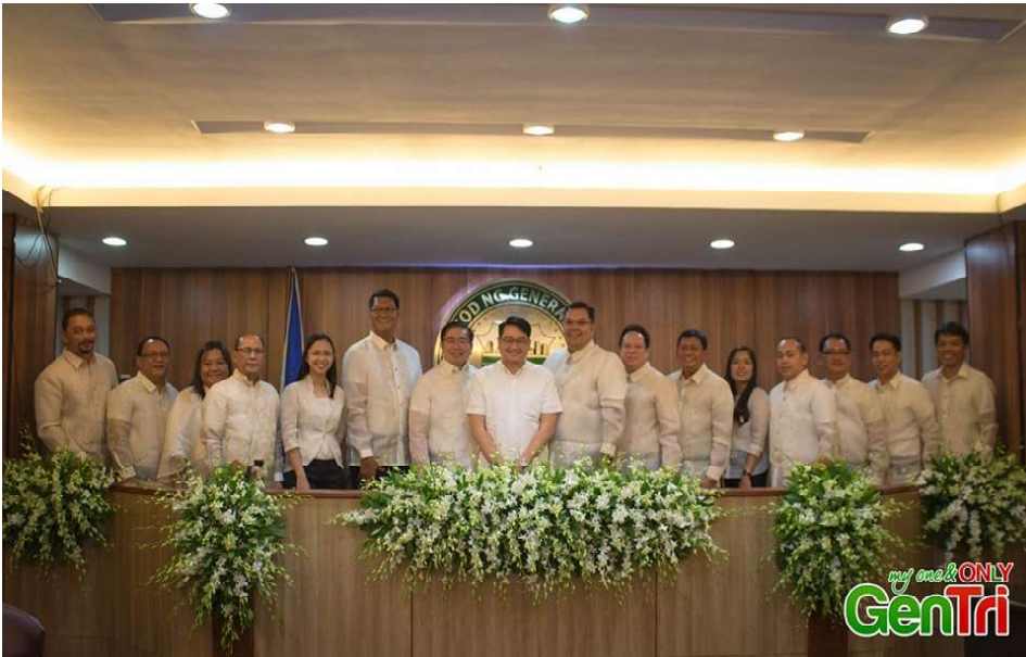
Inaugural Session of the 3rd Sangguniang Panlungsod of the City of General Trias.

These initiatives of the labor department are aligned with the Philippine Development Plan 2017-2022, which targets to reduce the cases of child labor by 30 percent or 630,000 from the estimated 2.1 million child laborers nationwide. /S.De Leon(PIA InfoComm/DOLE)