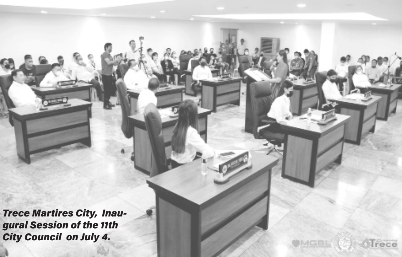
Trece Martires City, Inaugural Session of the 11th City Council on July 4.