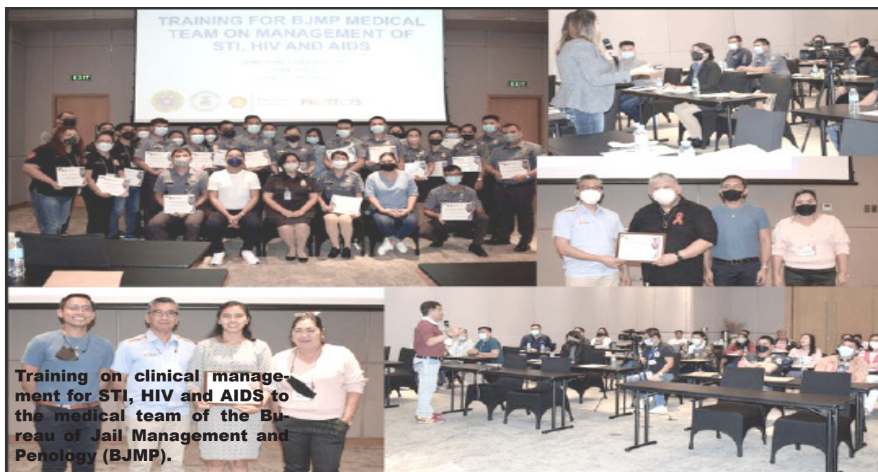
Training on clinical management for STI, HIV and AIDS to the medical team of the Bureau of Jail Management and Penology (BJMP).