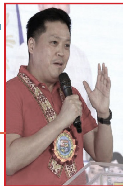
DSWD Secretary Rex Gatchalian