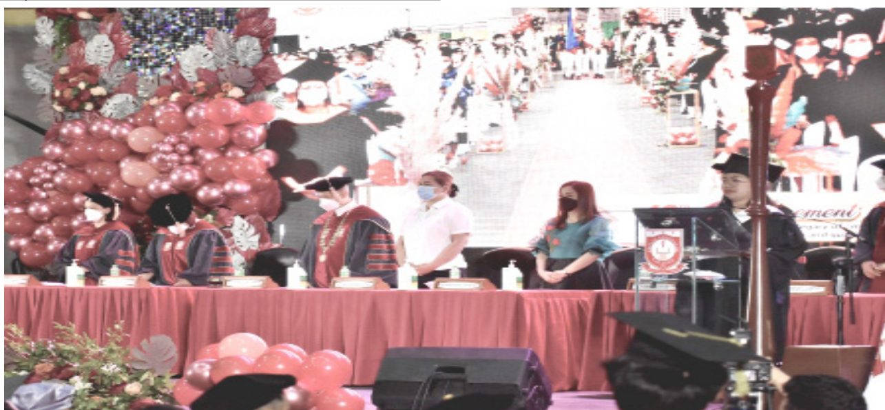
Vice President and now Department of Education (DepEd) Secretary, Sara Duterte-Carpio became the guest speaker during the graduation ceremony of students from Emilio Aguinaldo College.

The mayor is also calling on the constituencies to unite on waste management and arrangement to reduce these.