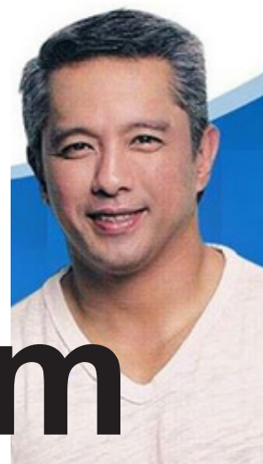
Cavite Governor Jonvic Remulla

Province of Cavite (PIA) -- In line with the province's efforts against coronavirus disease (COVID)-19, the provincial government is set to launch testing program for persons under investigation (PUIs).