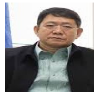
DILG Secretary Eduardo M. Año

or appendages crediting any local government official or bearing his name or image are also banned. "Huwag na po sana nating